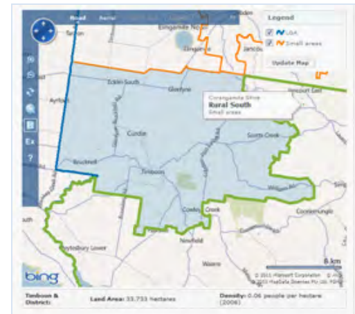
'Timboon and District' or 'Rural South'

Every single survey proposal submitted is recorded in the Appendix, aggregated by frequency within ten 'broad themes'. These ten themes are a summary of 23 'natural themes' identified within the language of the survey respondents.