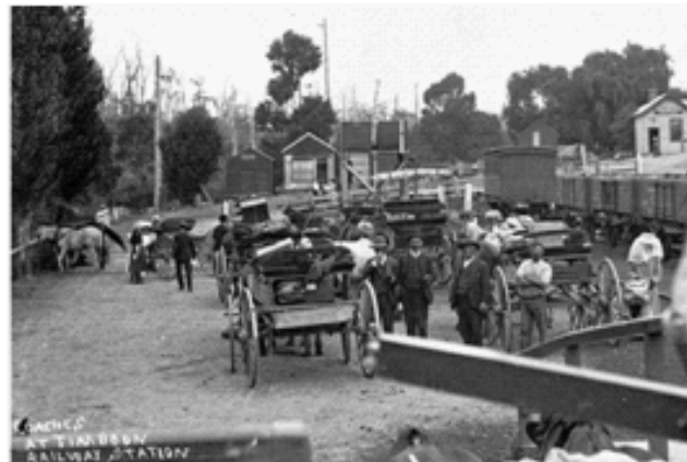
Timboon Railway Station, 1911

Timboon today remains a centre for the surrounding farming community, providing medical, health, education, recreation, retail, financial and farm services. Where the Timboon Cheese and Butter Factory was once a key local employer, Timboon has more recently gained a reputation for producing a variety of value-added niche food products. Local interests are working to develop a robust tourism industry based around a food trail and the natural assets of the district, linking up with 12 Apostles marketing and broader tourism strategies.