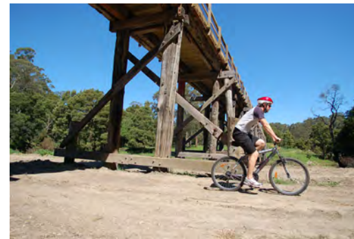
Curdies River Trestle Bridge

of priorities identified through the public meeting was markedly similar to those derived from the community survey, resulting in only one minor adjustment once the loading adjustment was applied to include the views of those who had not completed the survey.