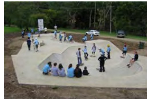
Timboon Skate Park