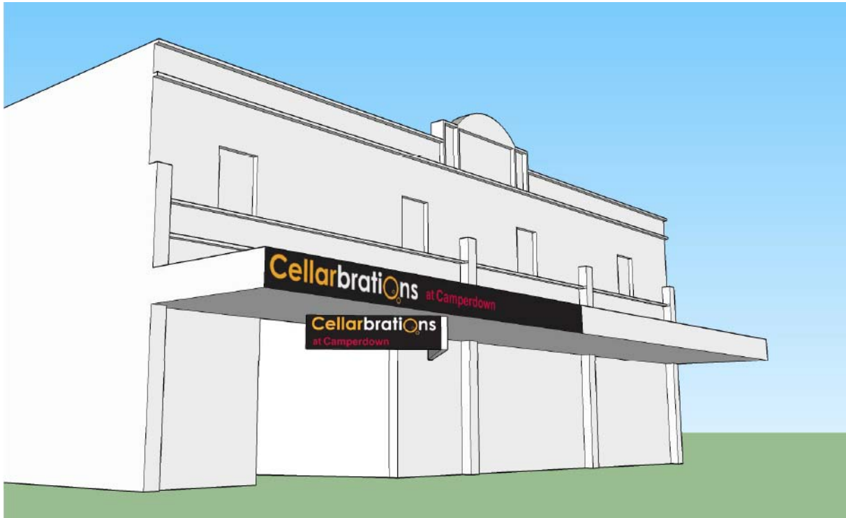
Figure 3: Signage sought at 169 Manifold Street, Camperdown

The applicant also seeks a full waiver of the car parking requirement needed under the Car Parking particular provision.