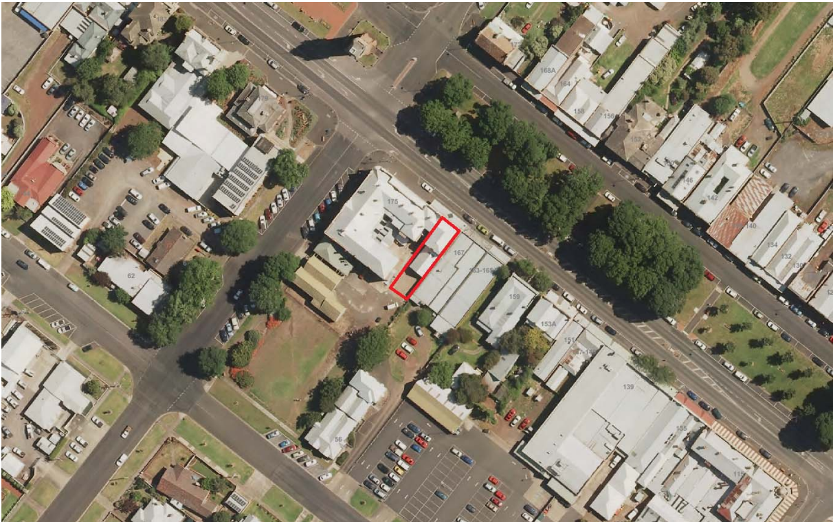
Figure 1: Subject Land at 169 Manifold Street, Camperdown