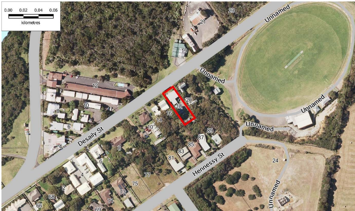
Figure 1: Subject Land and Surrounds