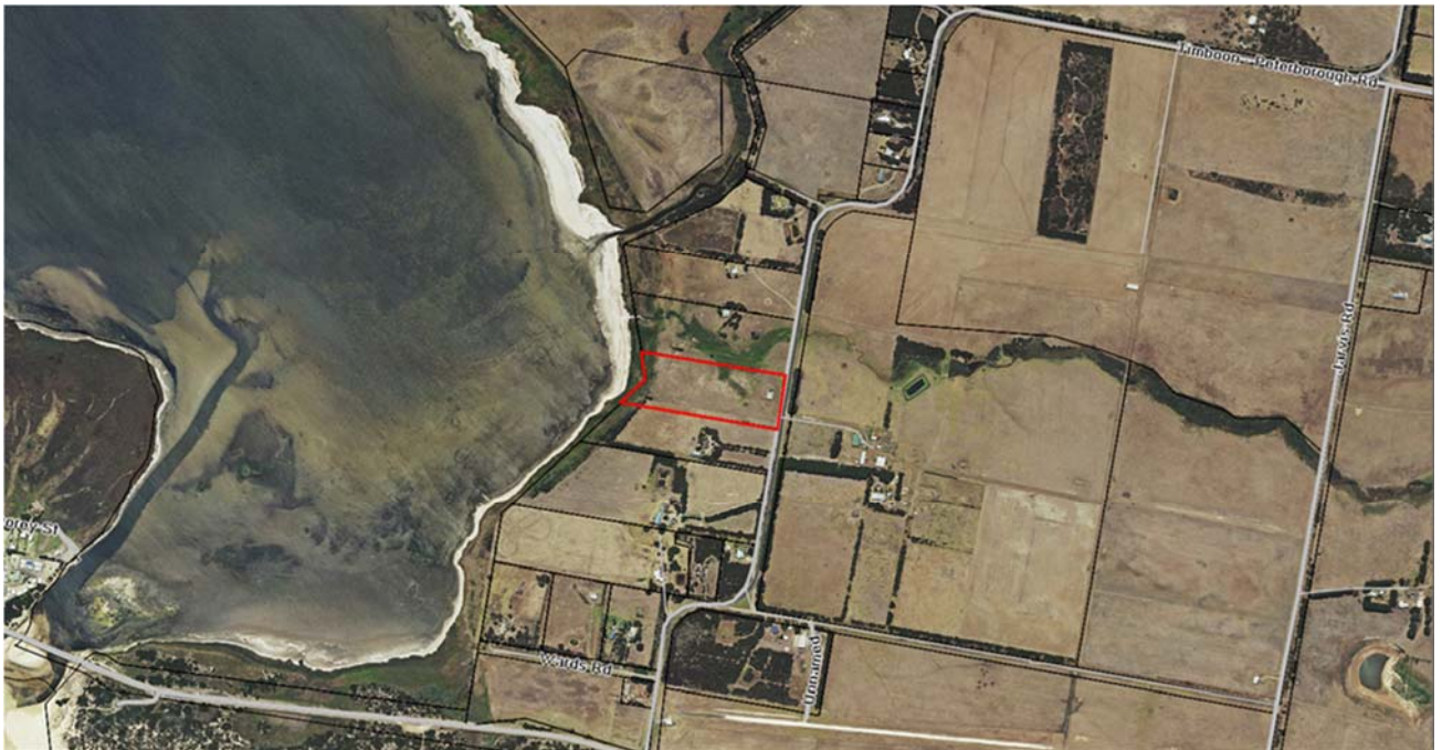
Figure 1: Subject site and surrounds