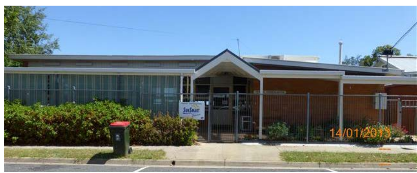
Figure 1: Former Terang Kindergarten, 8 The Promenade, Terang

The former Terang Kindergarten located at 8 The Promenade, Terang, is Crown land with Corangamite Shire Council appointed as the delegated Committee of Management for this building. Following the relocation of the kindergarten to the new Terang Children's Centre, the building has been utilised by Buckle My Shoe Pty Ltd under a sub-licence arrangement since 1 July 2016.