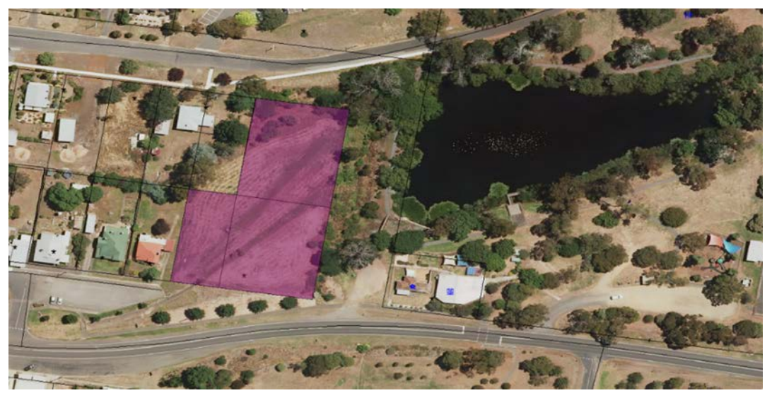
Figure 1: 12-14 Montgomery Street, Skipton

At the June 2017 Council meeting, Council resolved to defer the decision to sell the land located at 12-14 Montgomery Street, Skipton for two months to give the Skipton community the opportunity to develop plans for use of the site.