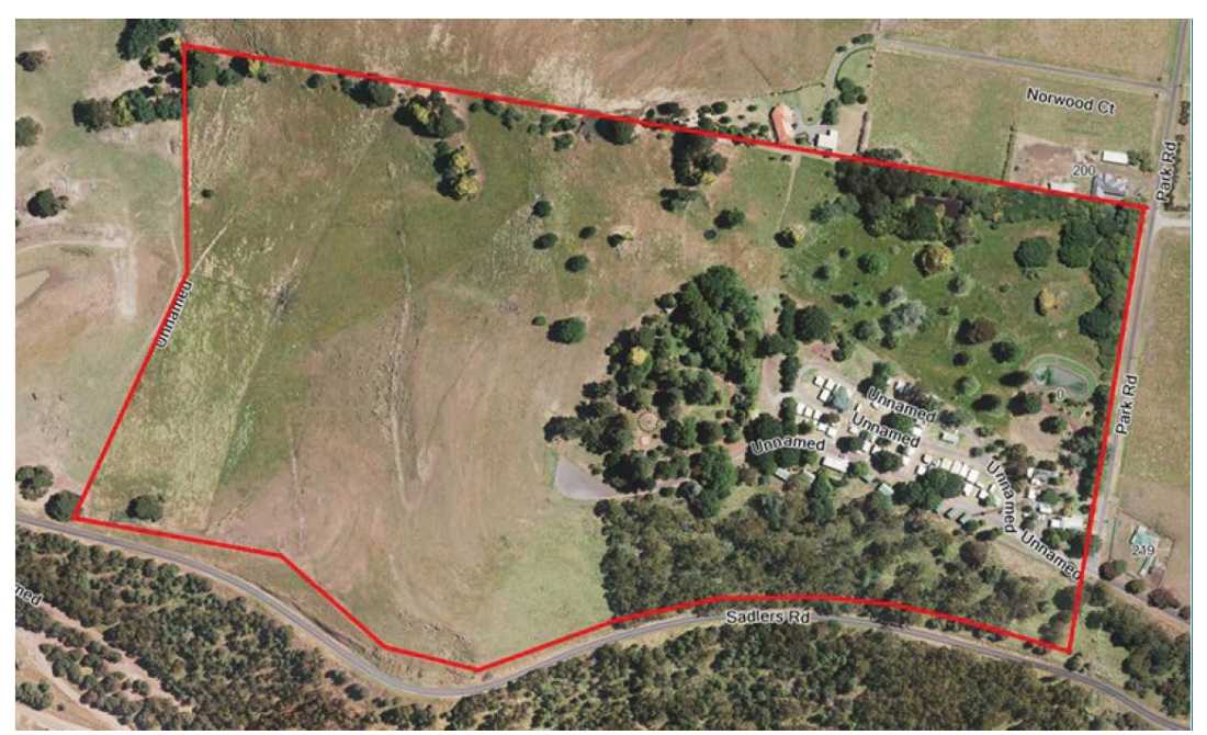
Figure 1: The identified area for the Conservation Management Plan

The Victorian Heritage Registration directed the preparation of a Conservation Management Plan (CMP) to inform the future management of the Botanic Gardens and Arboretum. A Conservation Management Plan is a plan to assist landowners and managers of a heritage place in making sound decisions about the management of the place. It identifies the heritage values, extent and significance and provides guidance on conservation, change and adaptation.