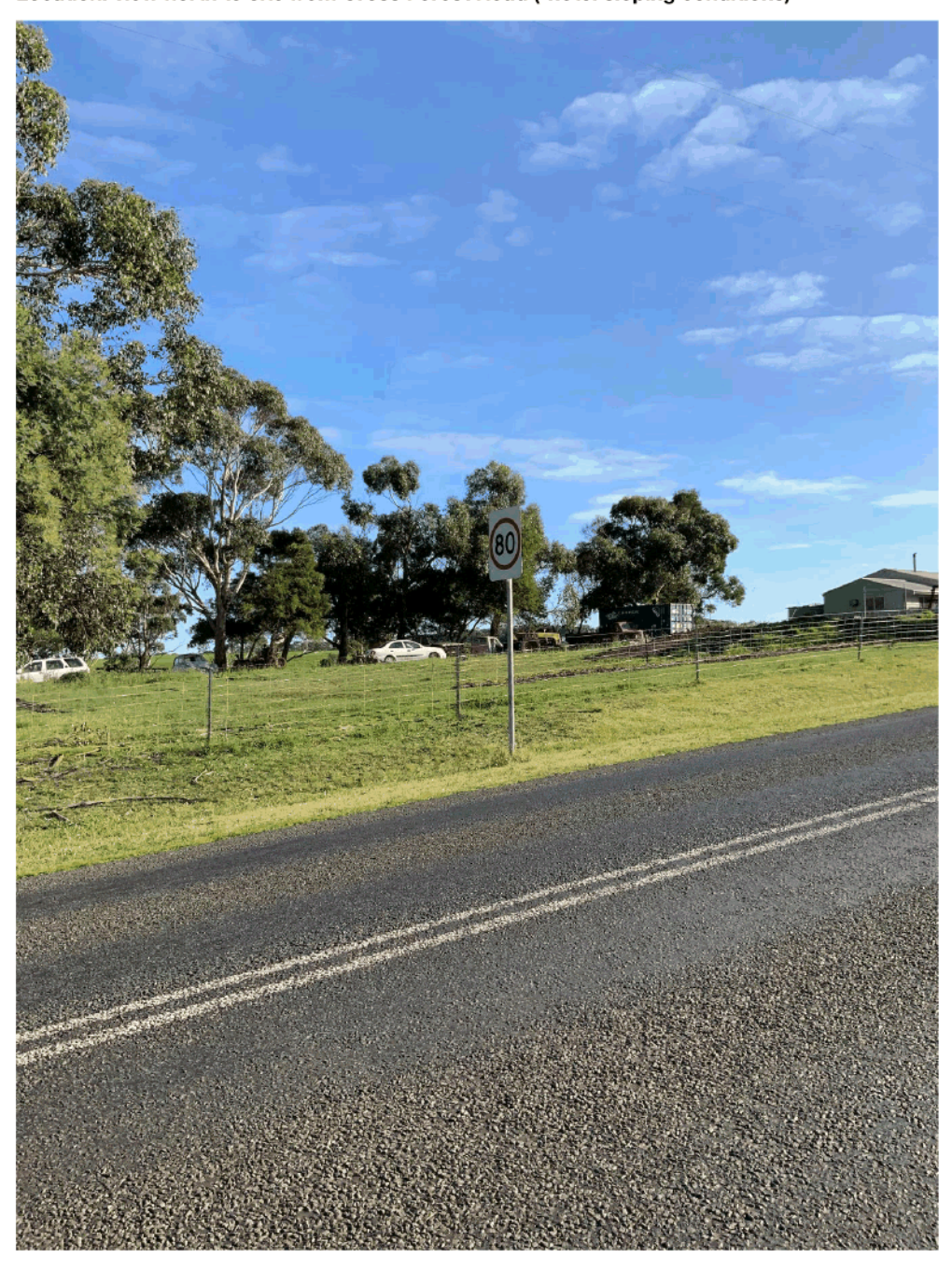
Page 6 of 7

Location: view north to site from Cross Forest Road (*note: sloping conditions)