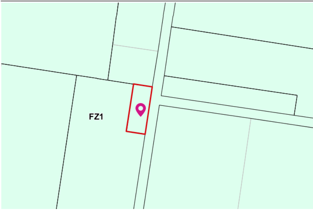
Figure 1. Planning Zone Map