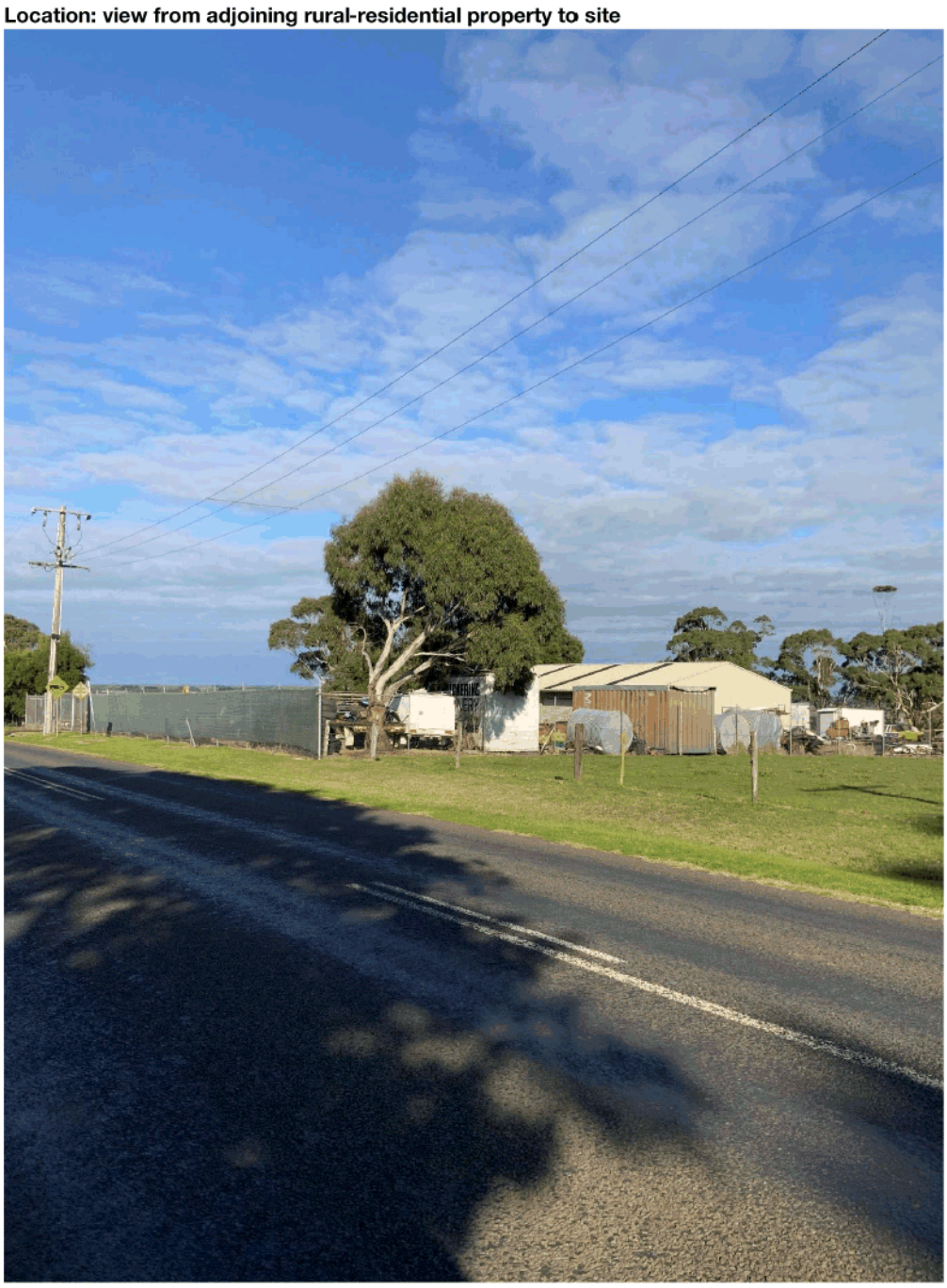
Page 2 of 7

Use and development of land for service industry and caretaker's house (variation to use and site management and landscaping conditions) 1108 Cross Forest Road, Cobden