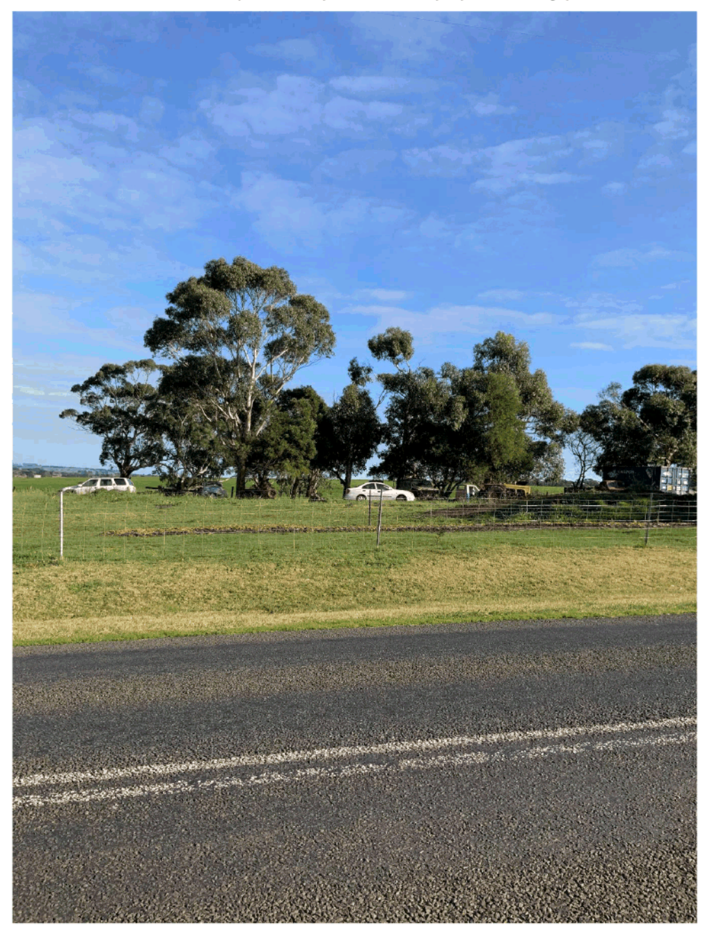
Page 5 of 7

Location: southern half of site (effluent disposal area and proposed storage)