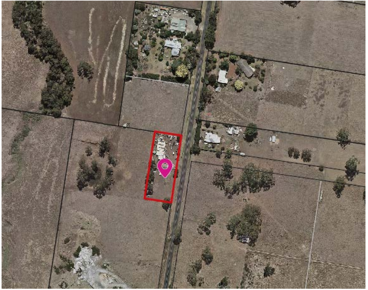
Figure 2. Aerial Map