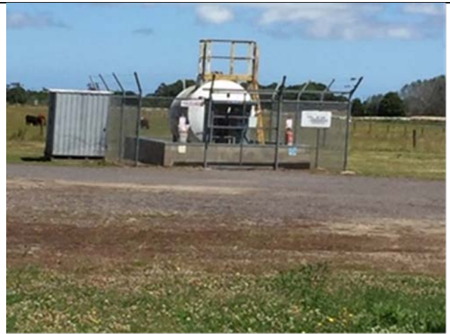
Figure 2: shows the AvGas fuel tank

The land consists of two lots, Lot 8 and Lot 9, on crown allotments 5A and 5B section 10 parish of Elingamite.