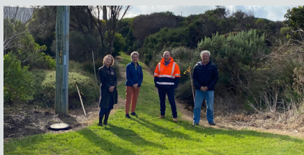
New walking track Port Campbell