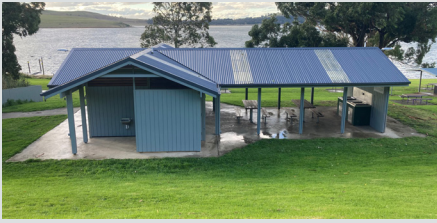
Lake Bullen Merri South Beach public toilet