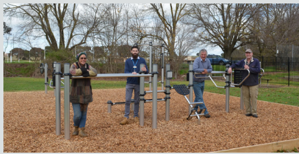
Exercise equipment Derrinallum