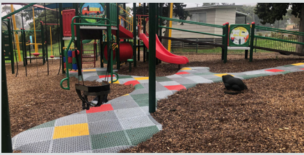
Playground upgrade Jubilee Park, Skipton