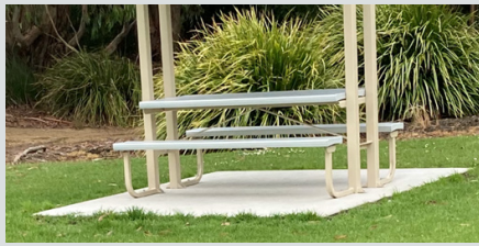
New shelter and tables Jaycees Park, Simpson