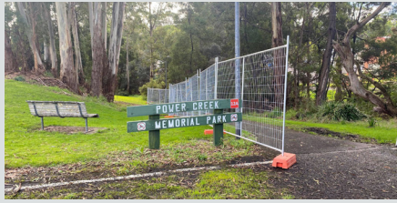
Timboon Stage 3 Town Centre Project