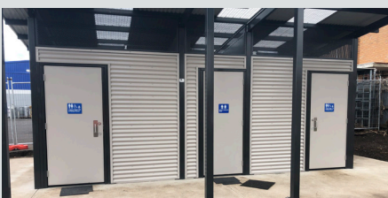
New public toilet Escourt Street, Terang