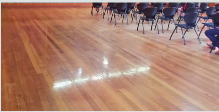
Floor reseal Cobden Civic Hall