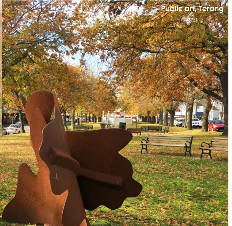
Public art, Terang