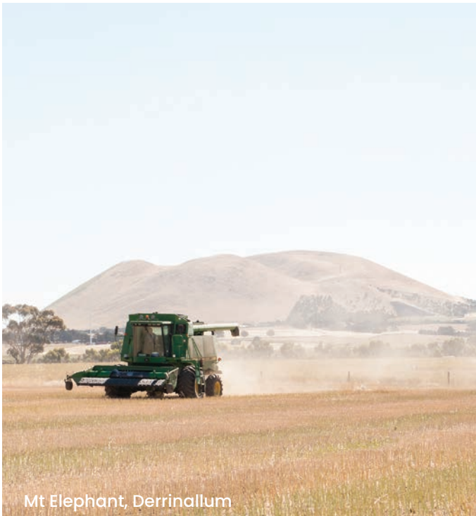
Mt Elephant, Derrinallum