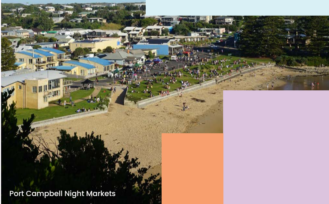
Port Campbell Night Markets