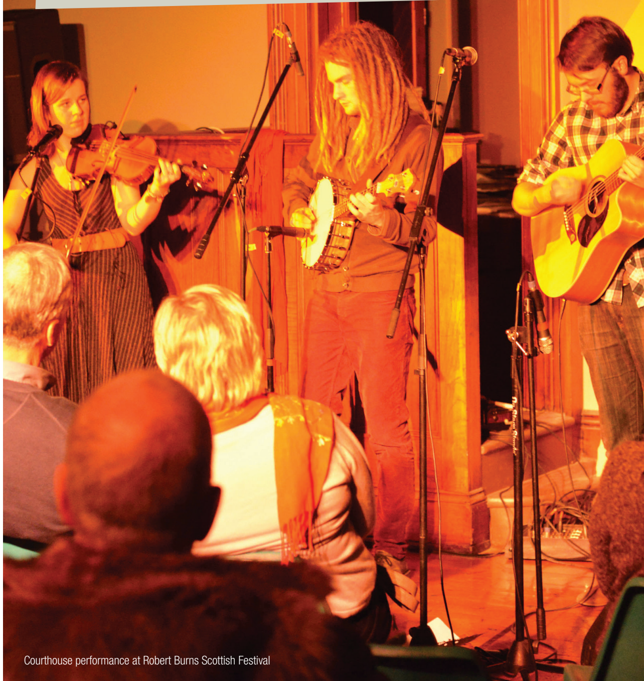
Courthouse performance at Robert Burns Scottish Festival