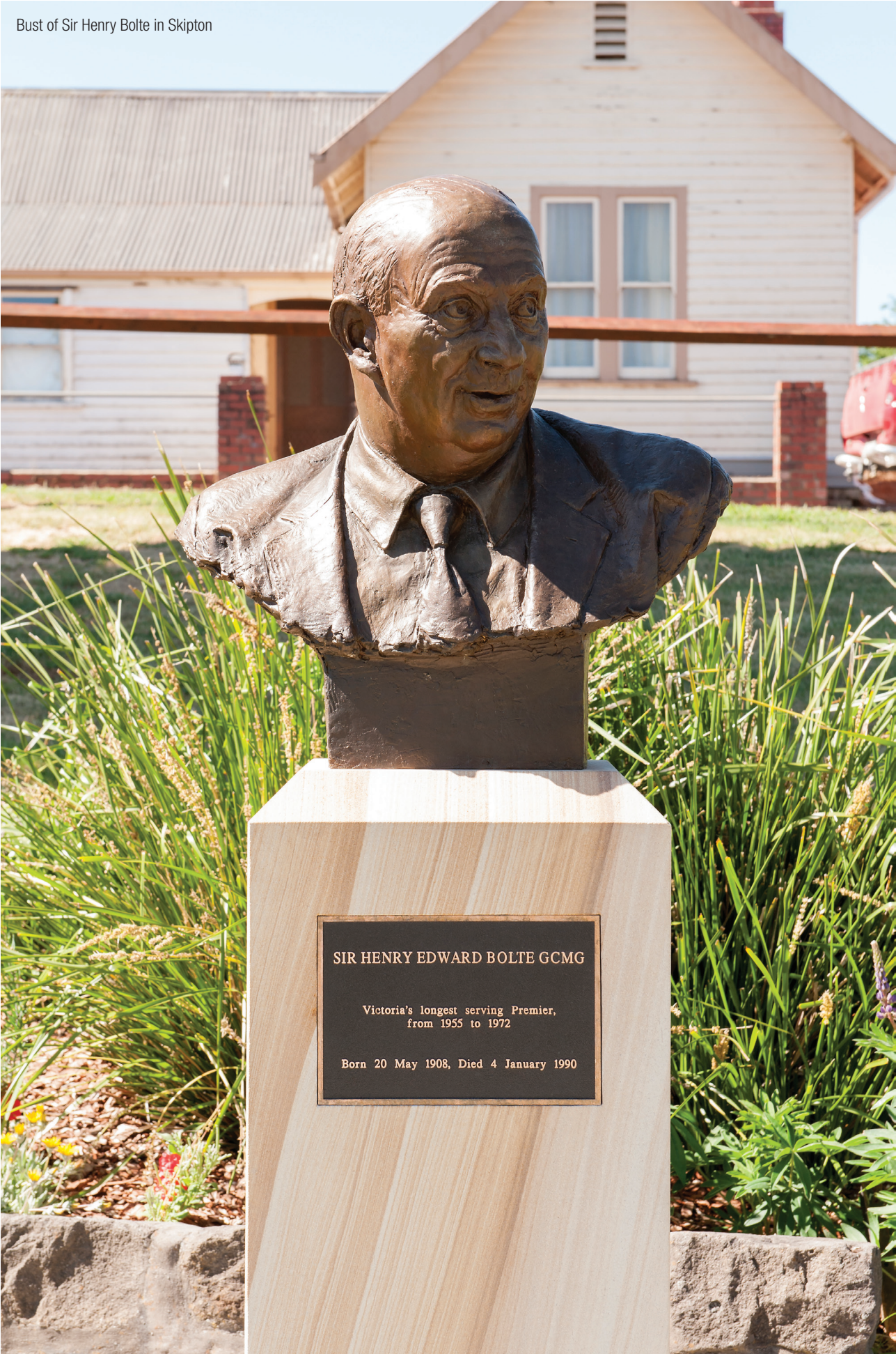
Bust of Sir Henry Bolte in Skipton

SIR HENRY EDWARD BOLTE GCMG Victoria's longest serving Premier, from 1955 to 1972 Born 20 May 1908, Died 4 January 1990