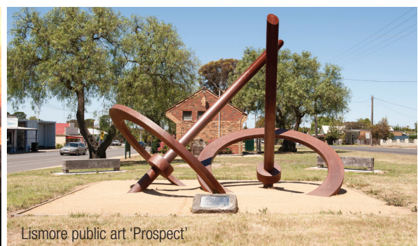
Lismore public art 'Prospect'