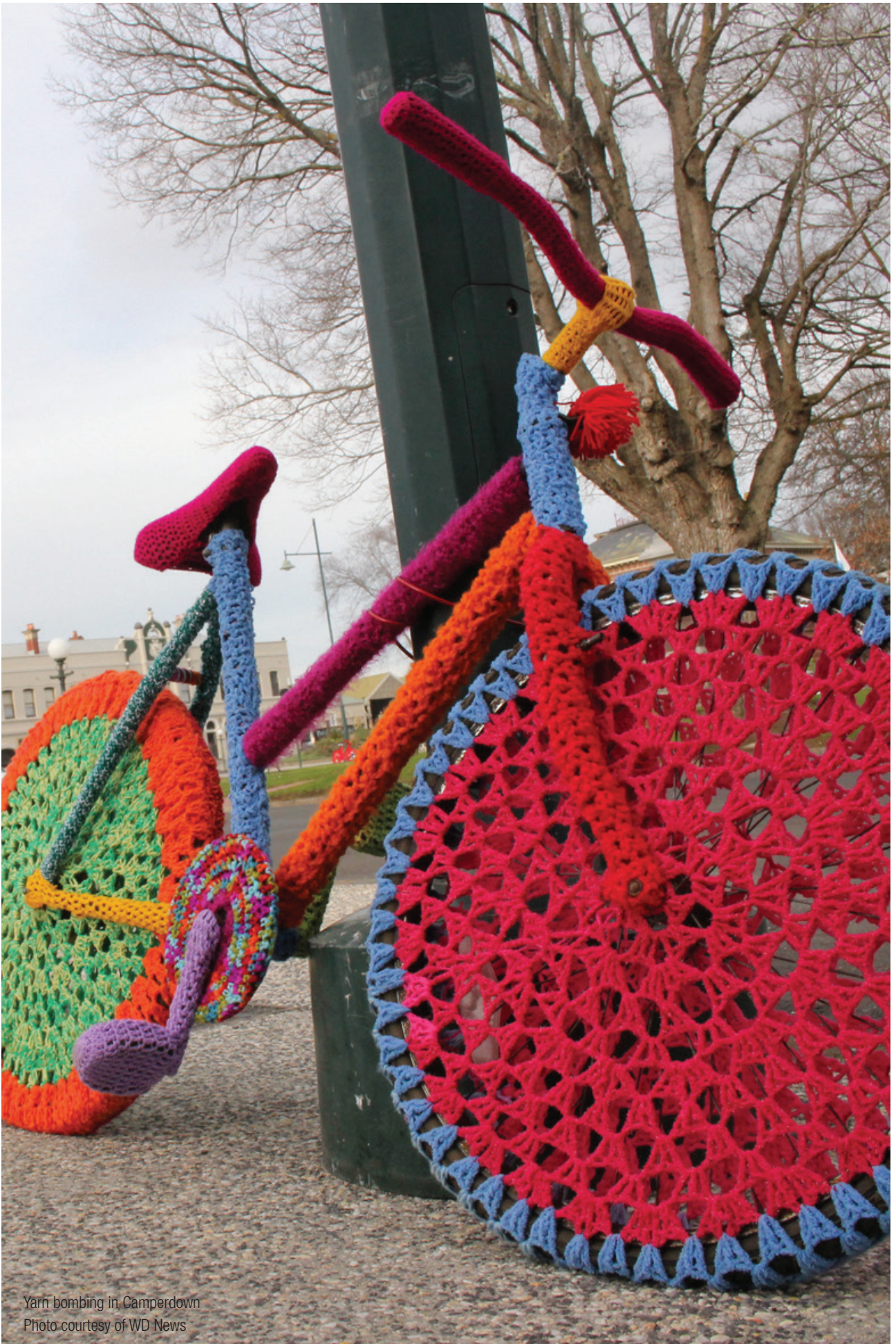
Yarn bombing in Camperdown