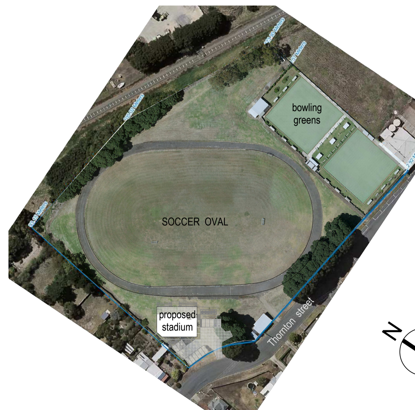
SITE PLAN 1:1500